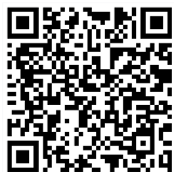
Scan for digital copy

Comprehensive pesticide screening performed using LC-MS/MS in accordance with ISO 17025 standards. Category I pesticides are banned substances with zero tolerance. Category II pesticides have established action levels. All results in ppm. ND = Not Detected.